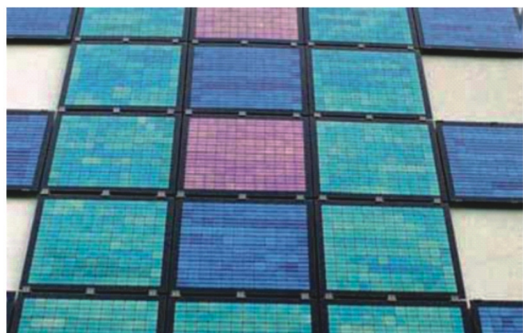
Figure 1. Residential premises with solar energy technology in North Reina – Westfalia (NRW), the color of a photovoltaic installation on a building (ASG) [10]