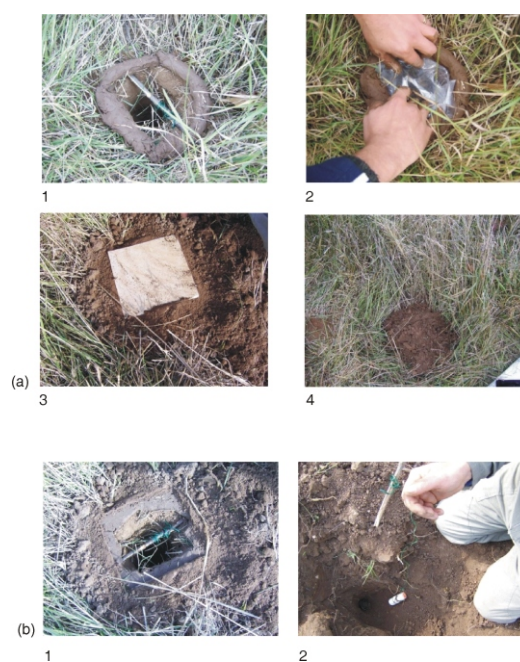
Figure 3. Installation (a) and collection (b) of the passive radon-thoron discriminative detectors

Additionally, at the same locations, five gamma dose rate measurements were performed. A scintillation counter was used, and the counting time was 100 seconds for each measuring.