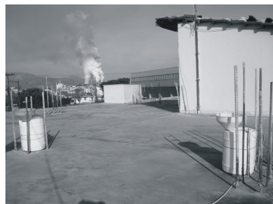
Figure 1. Precipitation sample collectors (power plants flue gas and humidity plumes front ahead)

The rain samplers used are presented in fig. 1, and consist of a HD polyethylene cylindrical container with the diameter of 30 cm, and height of 38 cm, and a